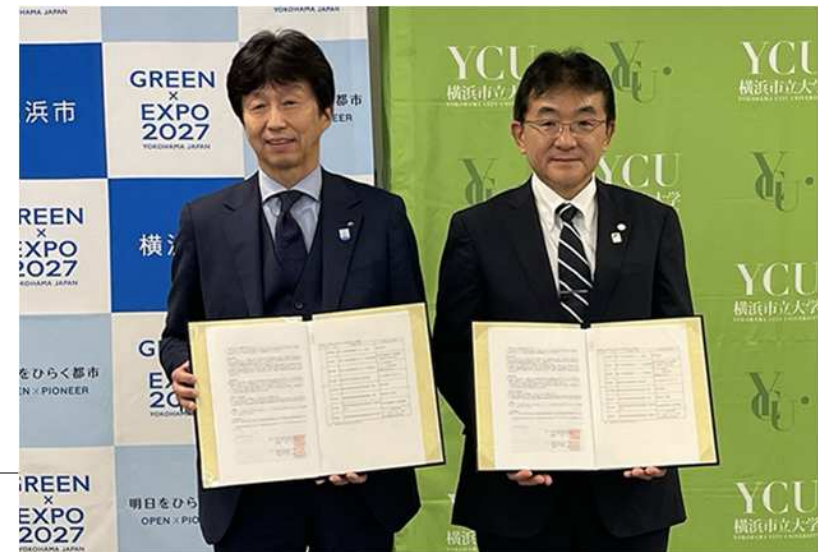
Signing Ceremony of the Joint Research Agreement between Yokohama City University and the Yokohama City Board of Education